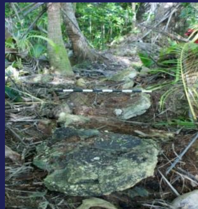
Cut beachrock paths

Objective: Terrestrial reconnaissance and selected test excavations to identify and date pre-western contact features; documentation of historic period features